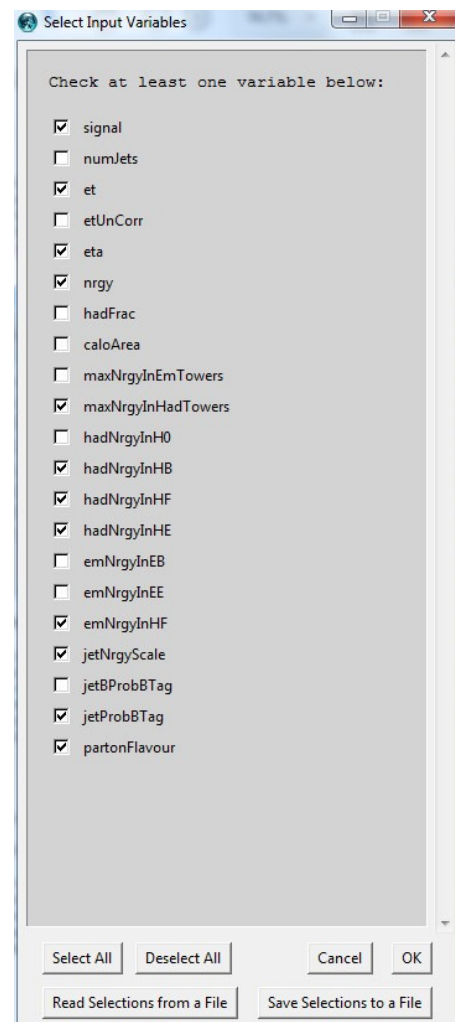
Figure 2. Variable Selection Window.